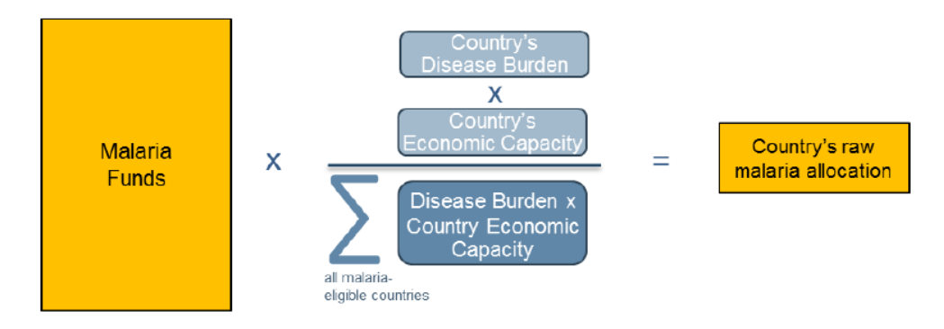
Figure 2: Example of calculating country's raw malaria allocation

For all countries eligible to receive funding for each disease, their raw allocation for the disease is determined by multiplying their disease burden<sup>1</sup> by their country economic capacity<sup>2</sup>. Each country's disease burden multiplied by their country economic capacity is then divided by the sum of disease burden multiplied by economic capacity for all eligible countries, which produces a share for each country. Each country's share is then multiplied by the total available funding for the disease to product an allocation amount. Here is an example of how a country's raw allocation is calculated in the case of malaria: