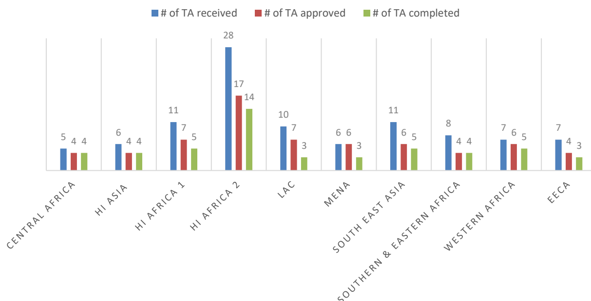
Figure 1: TA Requests Received, Approved, and Completed by Global Fund Region (July 2017 – December 2018)

Requests spanned all 3 disease components as well as systems for health. This includes 34 for HIV (22 approved and 21 completed), 35 for TB/HIV (24 approved and 18 completed), 7 for TB (4 approved and 3 completed), 11 for malaria (8 approved and 6 completed), 10 for all categories (4 approved and 2 completed), and 1 for resilient and sustainable systems for health (RSSH).