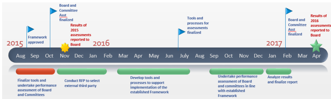
Figure 2: Timeline for implementation of Framework

21. Once the performance assessments of the Board and its committees have been completed, the results will be presented to the Board at the first Board meeting of 2017.