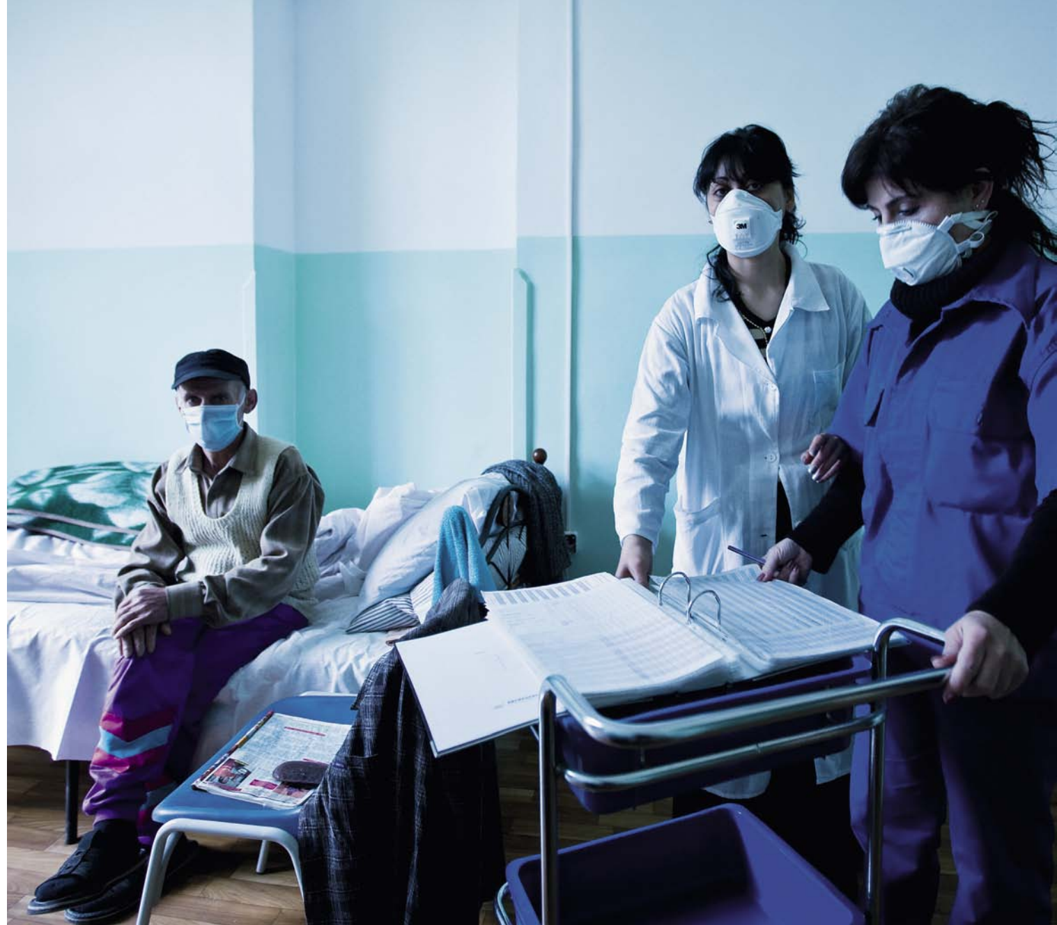
MDR-TB treatment in Georgia

The Global Fund is the major financer of MDR-TB treatment, supporting nearly 30,000 people enrolled in treatment. The threat of MDR-TB can be contained if progress continues at the current rate.