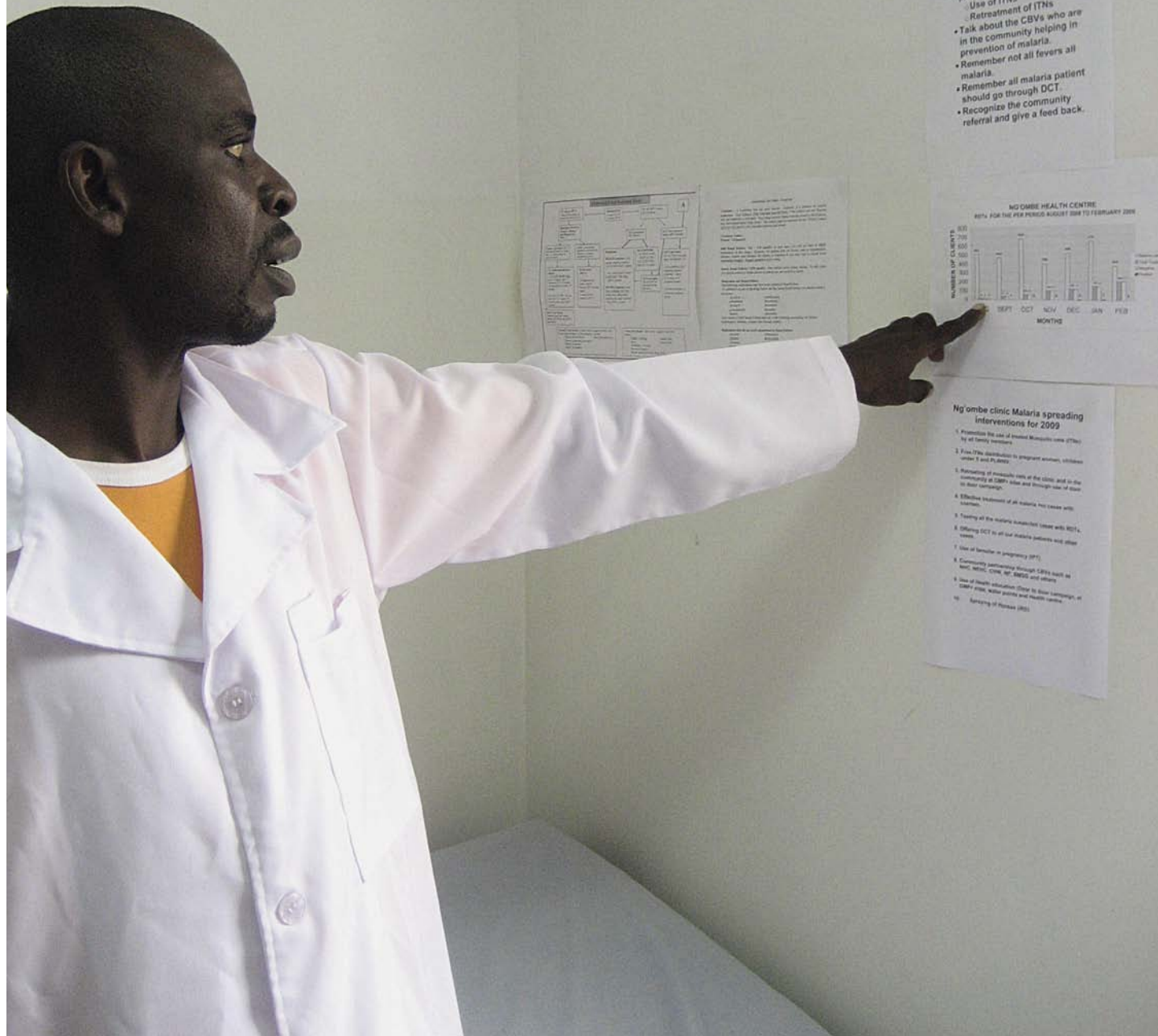
Malaria prevention in Zambia

Global Fund financing has played a decisive role in cutting malaria deaths by more than 50 percent in some countries.