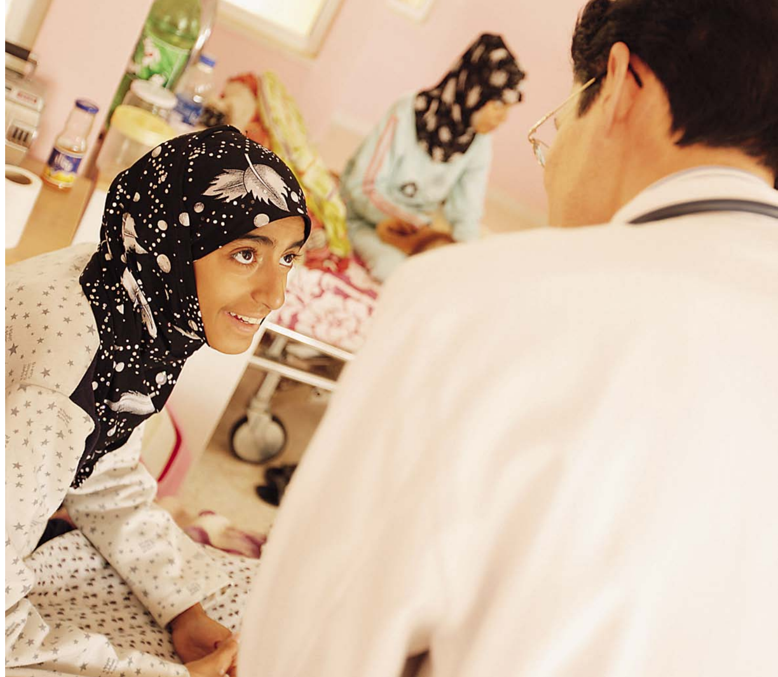
TB treatment in Jordan

TB cases detected and treated will continue to increase from 6 million to more than 10 million by 2012.