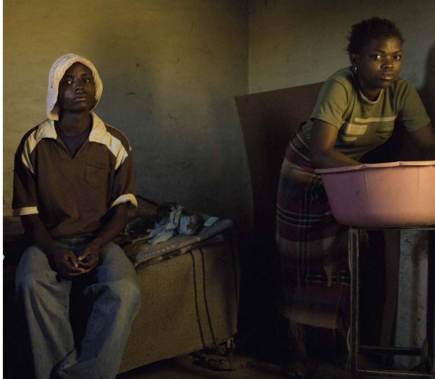
Orphans and other vulnerable children in Lesotho

Around 4.5 million care and support services have been provided to orphans and other vulnerable children since 2004. Around 1.5 million orphans are currently receiving support from Global Fund-financed programs.