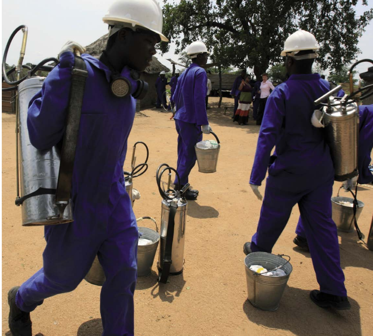
Malaria prevention in Swaziland

Worldwide, Global Fund-supported malaria programs have financed the spraying of homes more than 19 million times.