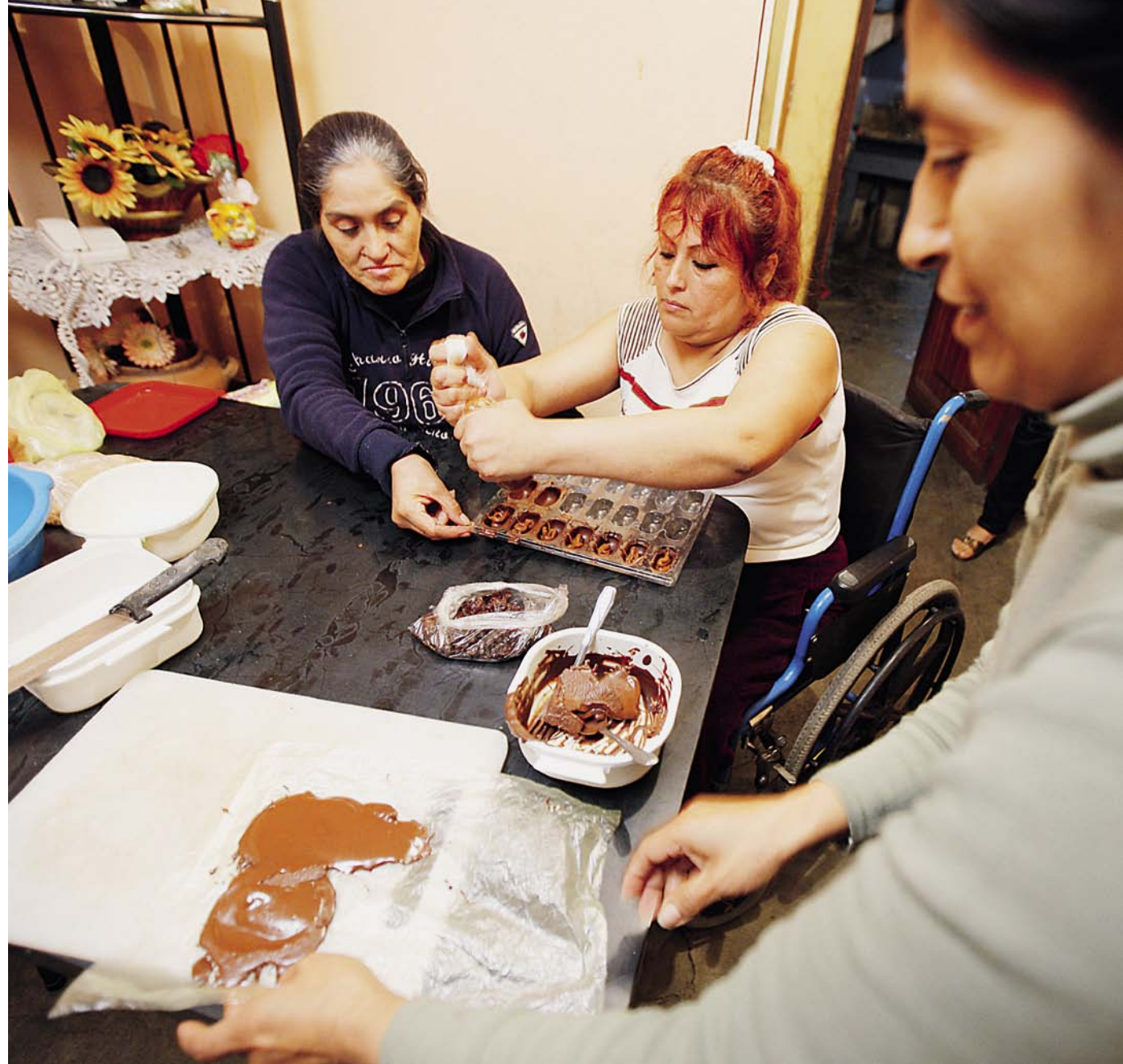
TB treatment in Peru

The Global Fund finances TB treatment through DOTS, the strategy recommended by the World Health Organization that has a defaulter rate of just 5 percent. Global Fund-financed TB programs include income-generating projects to help ensure TB patients are able to support themselves as they are cured.